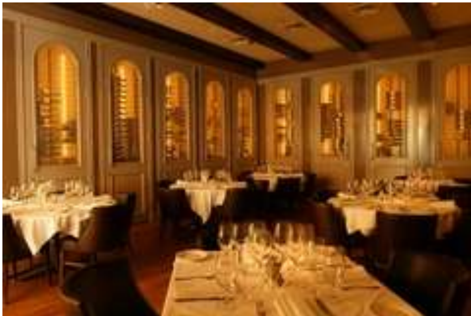
The upstairs "Wine Room" set for dining.

Brennan's of Houston has a rich history rooted in the 1967 opening as a sister restaurant to the world-famous Commander's Palace in New Orleans. Incorporating the freshest local ingredients, it offers exceptional dining a la Texas Creole , including many original creations among award-winning cuisine. From pan to plate to palate, the culinary professionals direct overwhelming passion for food and hospitality at creating great memories for every guest every time.